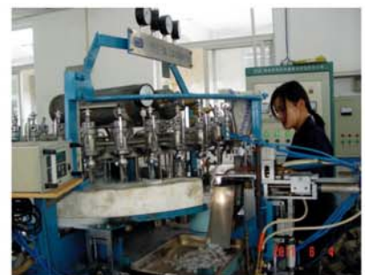
Working Atmospher Filling