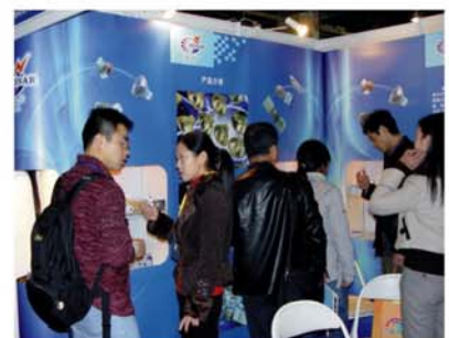
Booth at Medical Show