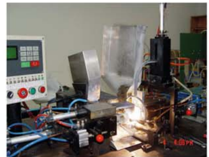
Bulb Shell Forming